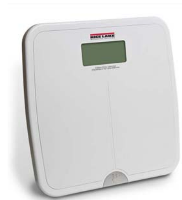
Figure 1. Adult & Child Scale