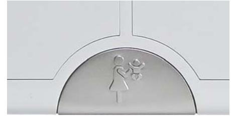
Figure 3. On/Off Button