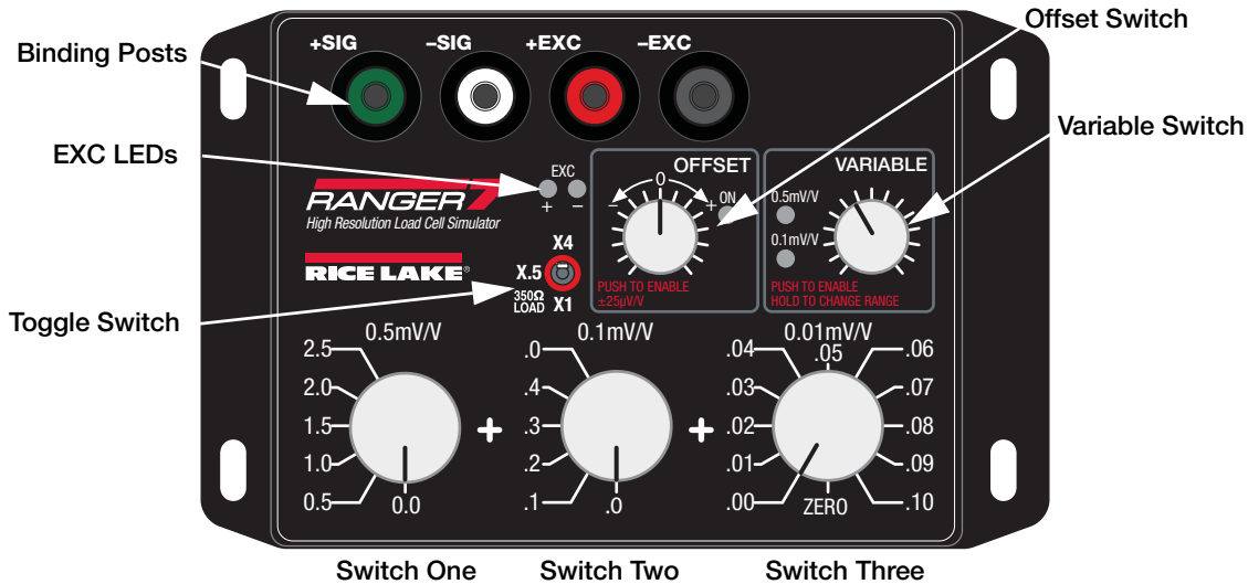
Figure 3-1. Ranger 7 Simulator