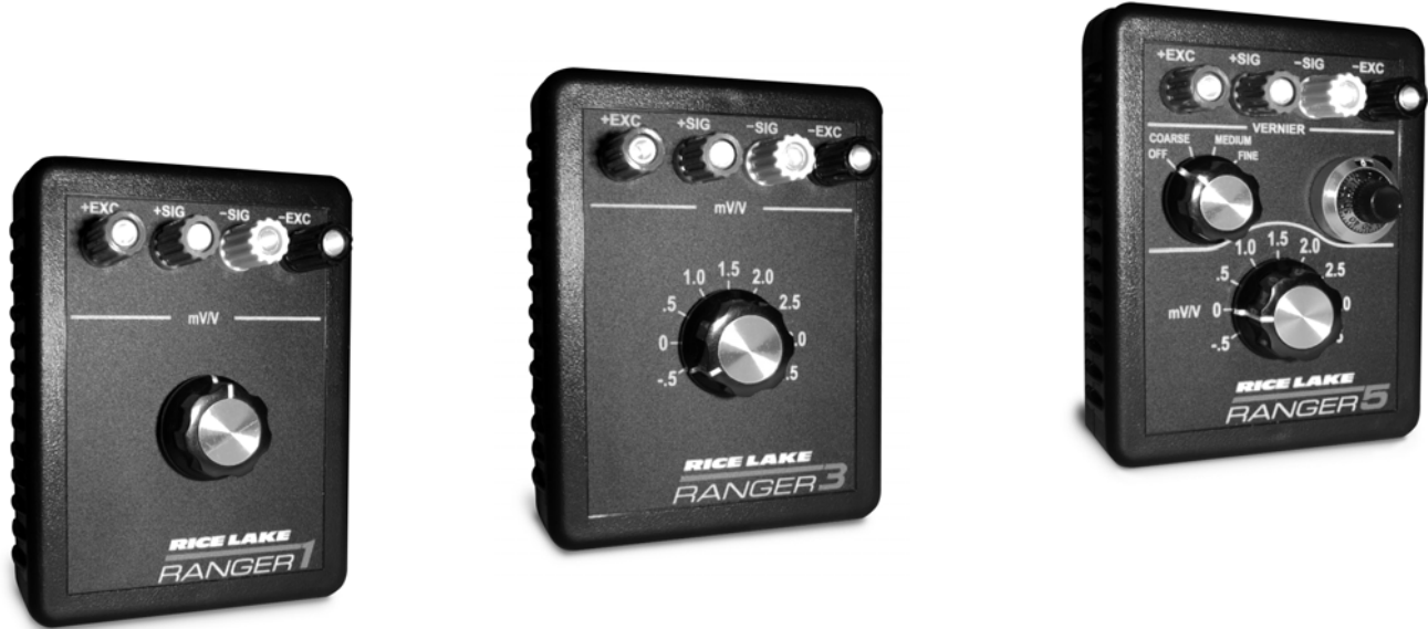
Figure 1-1. Ranger 1, 3 and 5 Simulators

Rice Lake Weighing Systems offers four models of the Ranger Series Simulators.