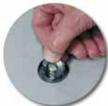
Dual corner locks secure the deck to the base for safety, durability, and convenience.

Legendary RoughDeck performance, innovative specialty features—the ultimate washdown solution.