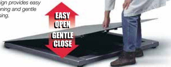
Unique dual gas-shock design provides easy opening and gentle closing.