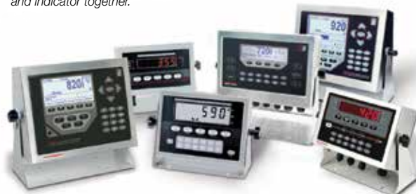
Choose from a versatile line of digital weight indicators.

Each scale is corner calibrated at the factory. Distributors must calibrate scale and indicator together.