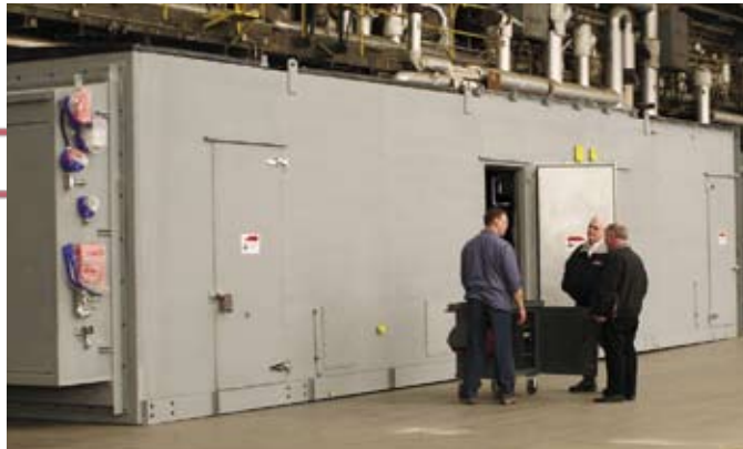
Bill Landry, Joe Geisser, Bob Dumas and one of DRS Power Technologies' portable power units.

The power unit is lifted with a crane, then four RL9000 TWM 100,000 pound weigh modules are positioned under each corner.