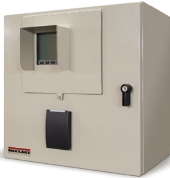
Shown with PN 176452