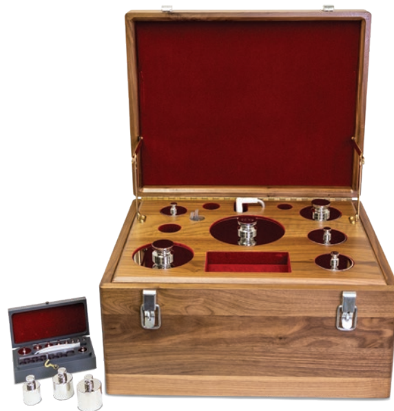
PN 11938 Set Includes Lifting Device, Glove and Case (20 kg to 1 mg)