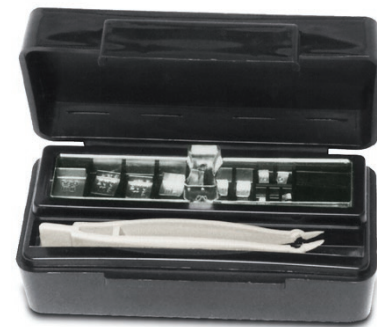
PN 12093 Set Includes Tweezer and Glove