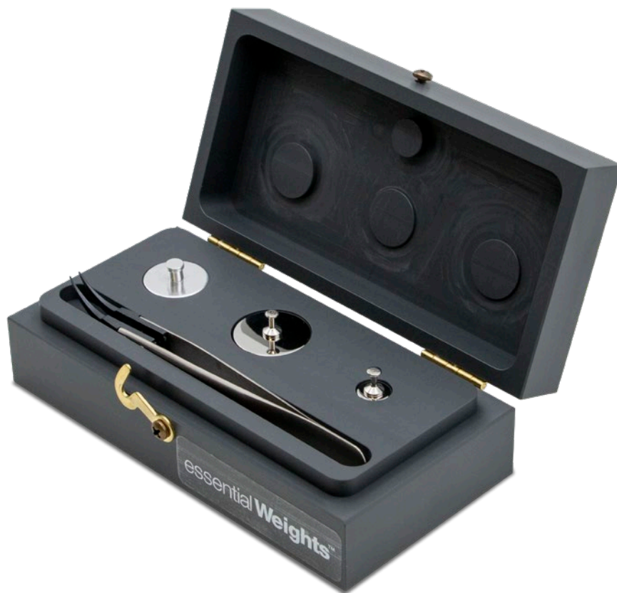
200g PVC Set Shown, Other Sets Will Vary