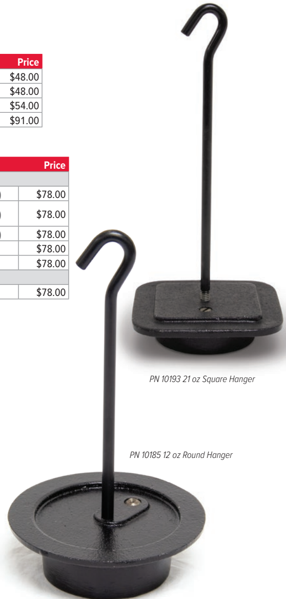
PN 10193 21 oz Square Hanger