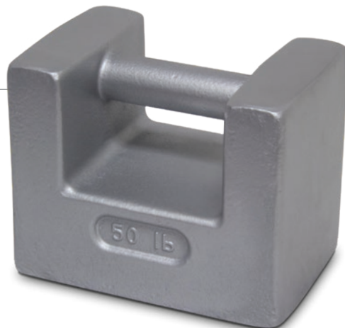
PN 12839 Grip-handle