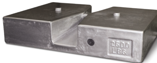
PN 12860 Nesting Slab

* Slot depth refers to distance between lifting bars and castings.