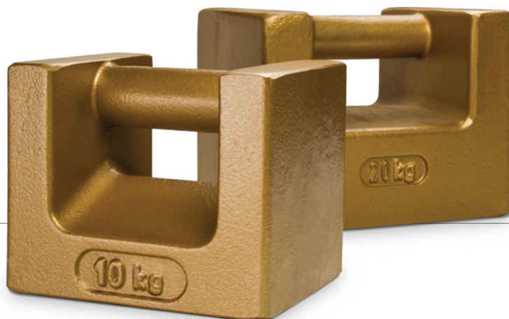
PN 12767 and PN 12771 OIML Grip-handle