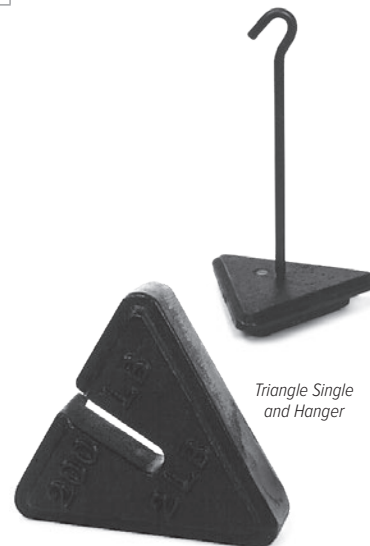
Triangle Single and Hanger