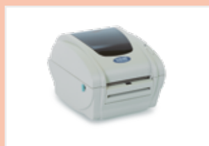
DIRECT THERMAL LABELLERS