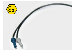
OPTICAL FIBRE FOR COMMUNICATION IN ATEX AREA