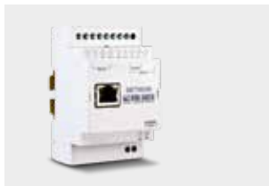
RS232 / RS485 / RS422