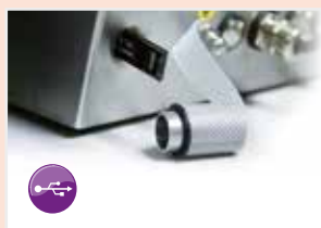
USB FLASH DRIVE

The USB flash drive is useful to store all weighings carried out by the scale for a further processing and storage on PC. It can store months of continuous work without ever have to download the data to a PC.