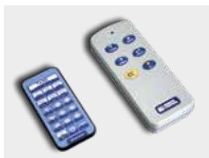
MULTIFUNCTION REMOTE CONTROL