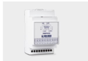
ETHERNET / MODBUS/PROFIBUS