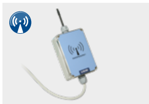
RADIOFREQUENCY VIA USB OR RS232