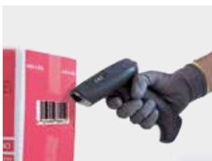
BAR CODE READERS