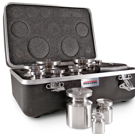
ABS Plastic Case (Weights shown are not included with case)