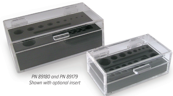
PN 89180 and PN 89179 Shown with optional insert