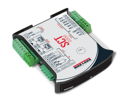
Optional SCT-2200 transmitter

Red +Excitation Black -Excitation Green +Signal White -Signal