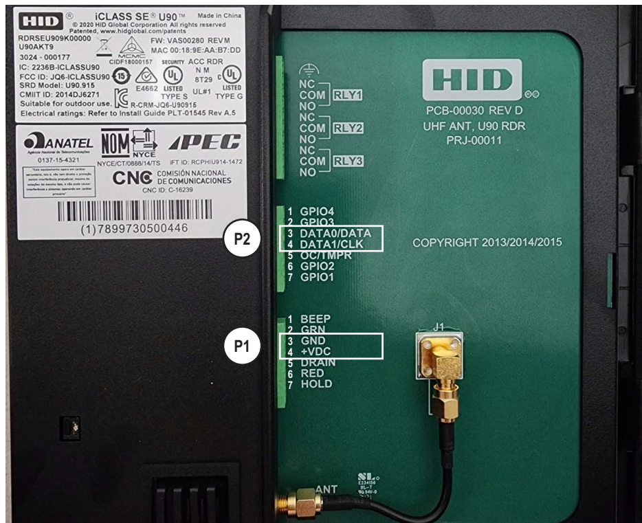
Figure 2. HID Long Range Reader Wiring