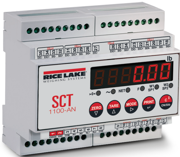
SCT1100-AN with Analog Output