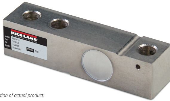
Picture is a representation of actual product.

Alloy Steel, Environmentally Sealed, OIML C3, IP67