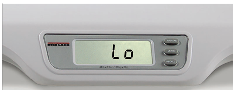
Figure 2-2. Low Battery Indicator

The VS-10 can also be powered by four AA alkaline batteries if an additional power source is not available. A battery powered scale automatically turns off after two minutes of not being used to save battery life. Replace the batteries or connect to an AC power source as soon as possible if the low battery indicator ( Lo ) displays.