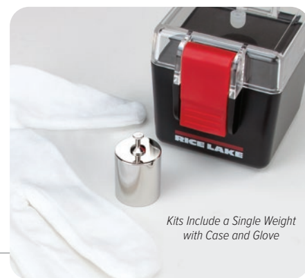
Kits Include a Single Weight with Case and Glove

ASTM PRECISION OIML PRECISION BALANCE CALIBRATION STAINLESS FIELD WEIGHTS CAST IRON FIELD WEIGHTS SPECIALTY ACCESSORIES