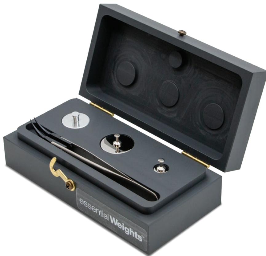
200g PVC Set Shown, Other Sets Will Vary