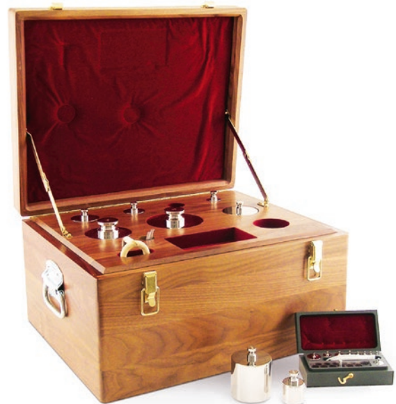
PN 12485 Set Includes Lifting Device, Glove and Case (10 kg to 1 mg)