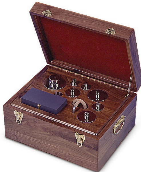
PN 11995 Set Includes Lifting Device, Glove and Case (10 lb to 1/32 oz)