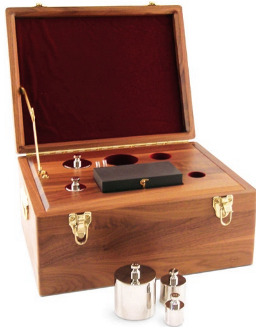
PN 11887 Set Includes Lifting Device, Glove and Case (3kg to 1g)