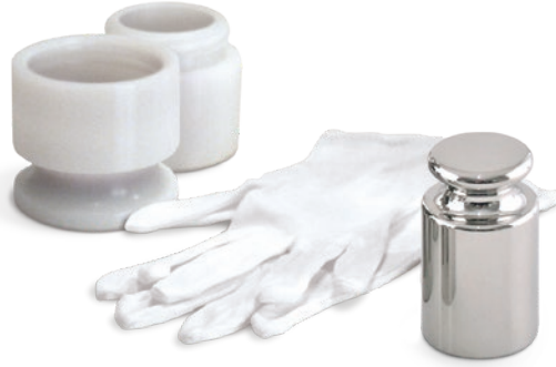
Kits Include a Single Weight with Case and Glove