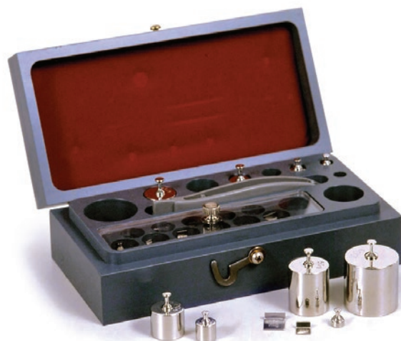
PN 12457 Set Includes Lifting Device, Glove and Case