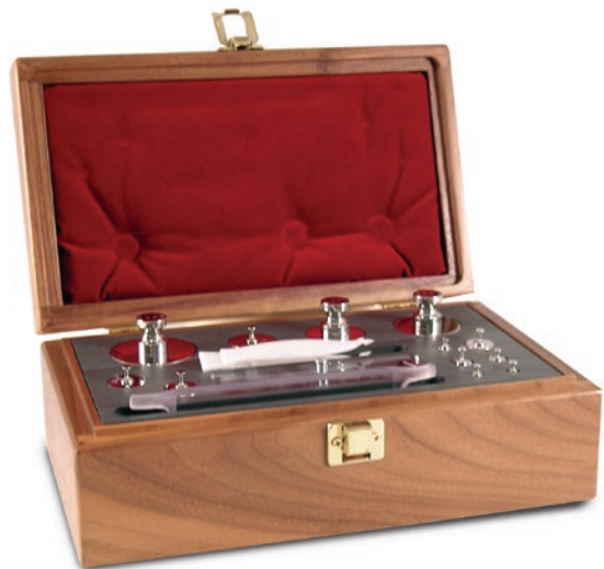
PN 12151 Set Includes Lifting Device, Glove and Case (500 g to 1 g)