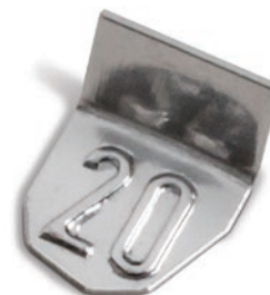
Leaf (Milligram) Weight