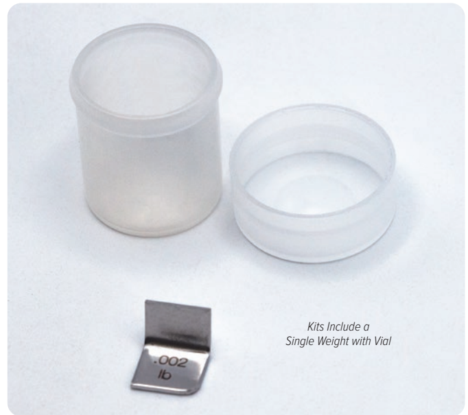
Kits Include a Single Weight with Vial