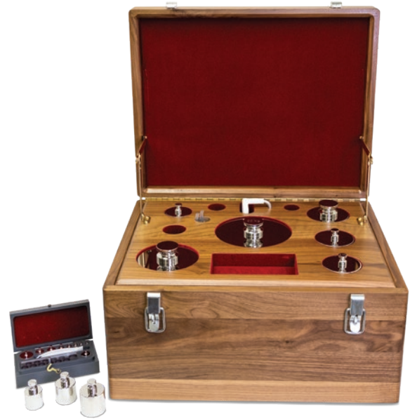
PN 11938 Set Includes Lifting Device, Glove and Case (20 kg to 1 mg)