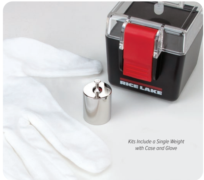
Kits include a Single Weight with Case and Glove