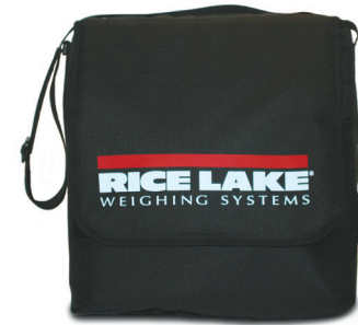
Optional carrying case