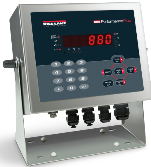
880 Plus Universal

Programmable Weight Indicator and Controller