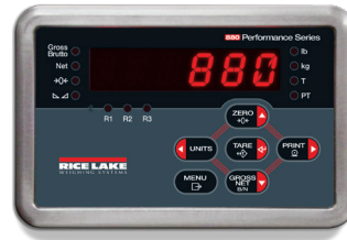
880 Panel Mount