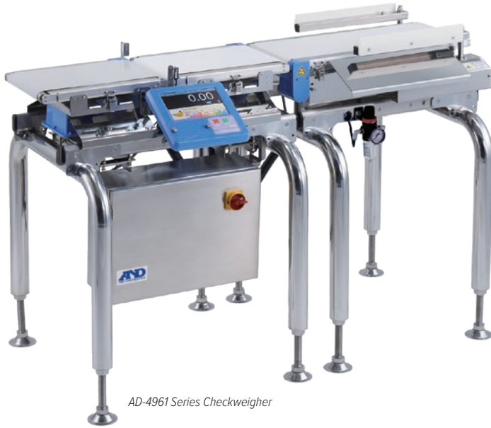
AD-4961 Series Checkweigher

In-Motion Checkweigher and Metal Detector