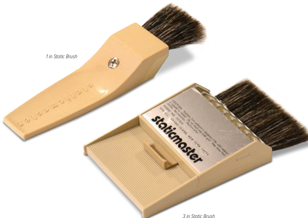
1 in Static Brush

The box must be clearly marked with "UN2911" on the outside, so NRD knows what to do with them. An RMA is not required, and there is no charge for a recycling fee.