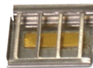
1 × 1 in Ionizing Strip