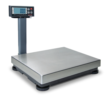
Shown with 174783