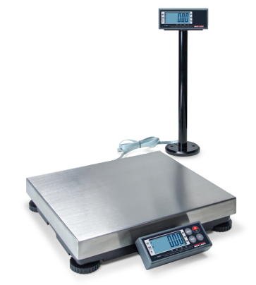
BP-P shown with 183103 and 180901