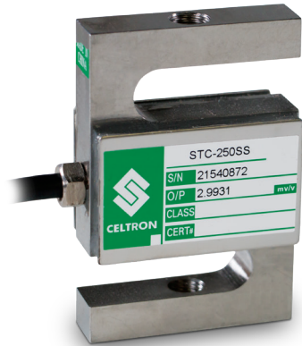
Picture is a representation of actual product