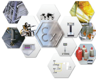
*GLP/GMP requires use of Combics 1 Plus or higher digital weight indicator