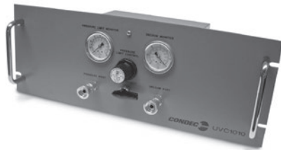
UVC1010, 19 inch wide rack-mount Consult Factory for Availability