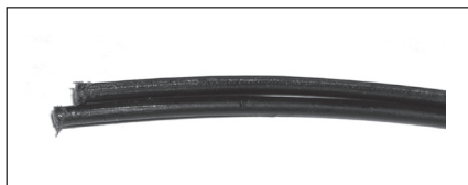
Color Code: Black-TXD, Blue-RXD