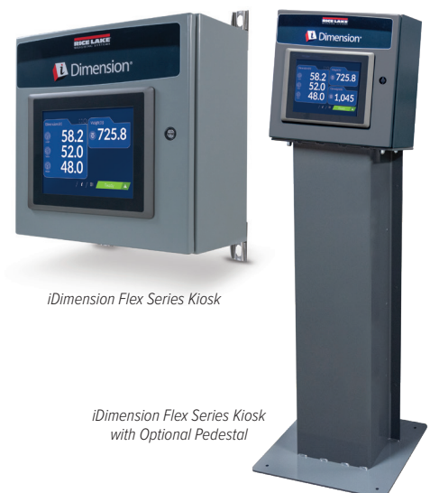
iDimension Flex Series Kiosk