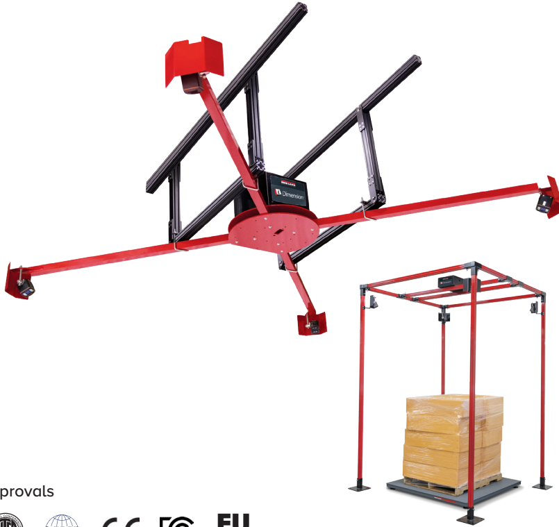
Suspended or Free-standing mount options available