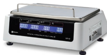
L1 Customer Display Bench Unit