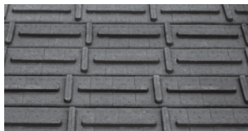
X-Lug rubber floor