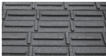
X-Lug rubber floor