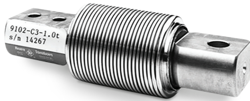
Picture is a representation of actual product

Stainless Steel, Welded-seal, NTEP Certified 1:5,000 Class III Multiple Cell, IP66/68