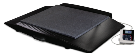
Optional heavy-duty mat