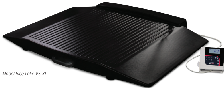
Model Rice Lake VS-31