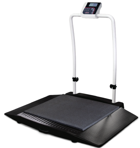
Optional heavy-duty mat