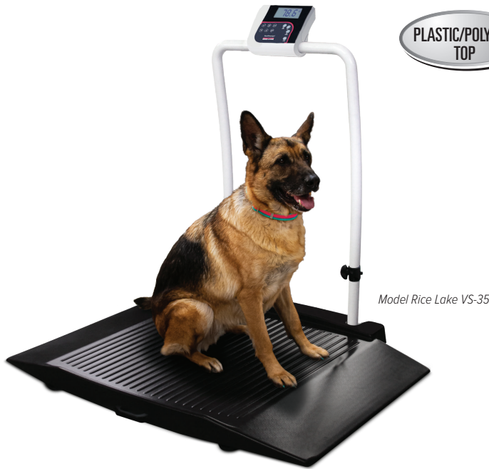
Model Rice Lake VS-35