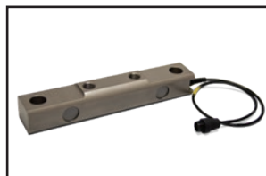
PL9000-14.4 Load Cell, PN 115345