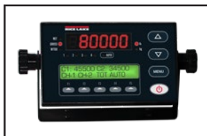
9700 Series Indicator, PN 114186