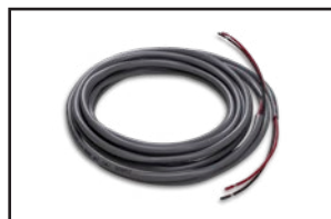
Power Cable, PN 115093