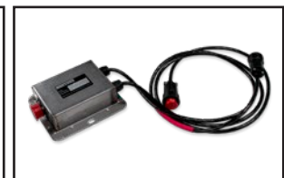
Transmitter, PN 114190