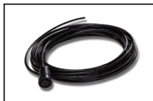
Cable Assembly, PN 114199