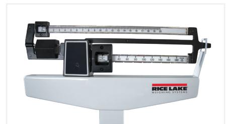
Weigh beam with kg markings