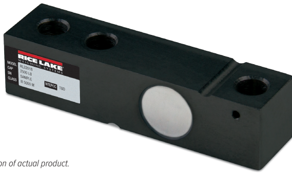
Picture is a representation of actual product.

Alloy Steel, Environmentally Sealed, NTEP Certified 1:5,000 Class III Multiple Cell, IP66