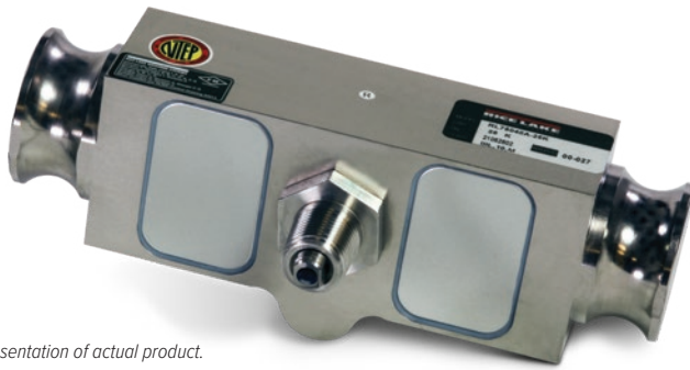
Picture is a representation of actual product.