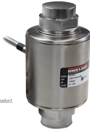
Picture is a representation of actual product.