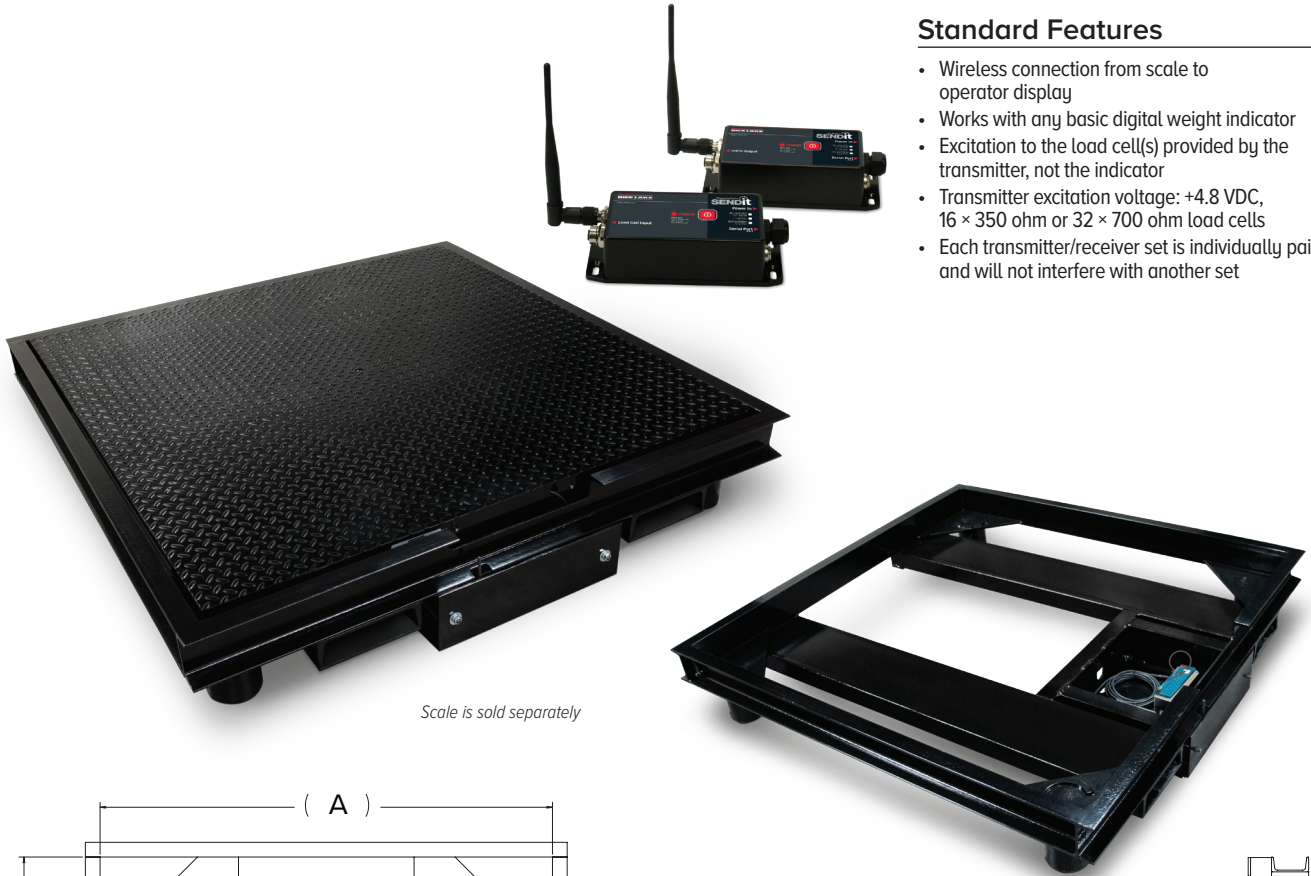
Scale is sold separately