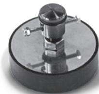
SLB, SB4, SB5, SB14 and SB6