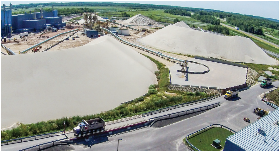
The SURVIVOR OTR-IMS can be used with new or existing SURVIVOR OTR scales. Please consult the factory to discuss application requirements and for complete specifications and price quotations.