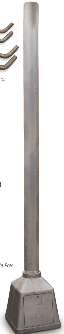
Traffic Light Pole