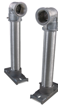
Side Mount Brackets