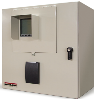
Shown with PN 176452