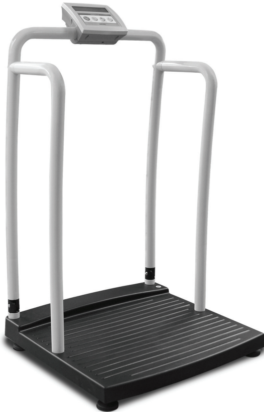
Figure 1-1. Digital Handrail Scale

This manual can be viewed and downloaded from the Rice Lake Weighing Systems web site at www.ricelake.com/health . Technical information on this product and other medical products are also available on the Rice Lake Weighing Systems web site. Rice Lake Weighing Systems is an ISO 9001 registered company.