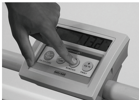
Figure 2-3. Press the Reweigh Key to Verify Weight

Once the scale is properly unpacked and set up, and prior to weighing a patient, step on the scale to check the scale that all functions are working correctly. The scale is calibrated from the factory so simply turn on the scale and step on the scale to get a weight reading. Press the REWEIGH key again to verify that weight.