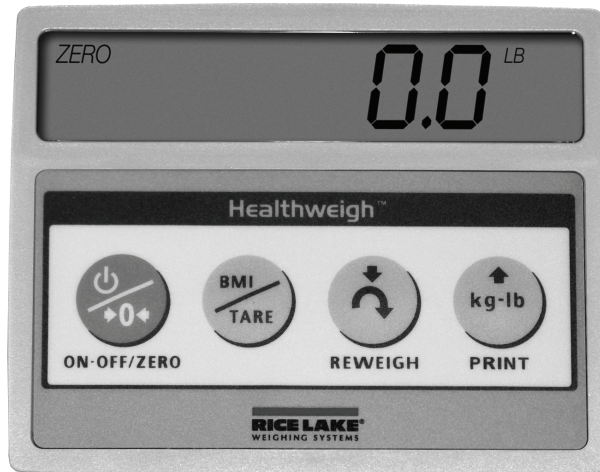
Figure 3-1. Front Panel Display Keys

The display has various front panel keys. They are shown below.