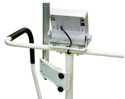
Figure 3. Secure Height Rod Assembly