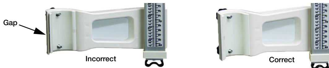
Figure 2. Bracket Insert Placement