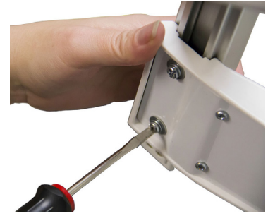
Figure 4. Height Rod Adjustment