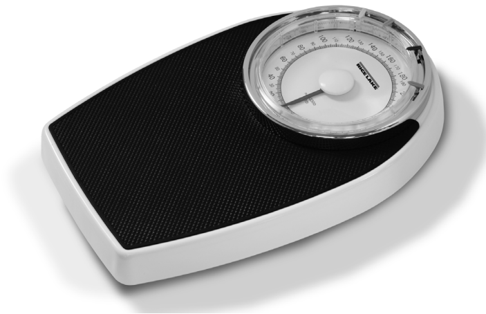
Figure 1. RL-330HHL (shown)

This manual can be viewed and downloaded from the Rice Lake Weighing Systems web site at www.ricelake.com/health . Rice Lake Weighing Systems is an ISO 9001 registered company.