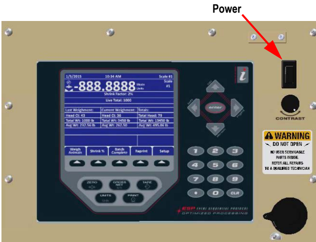
Figure - 1. Indicator Front Panel

Do not remove or obscure warning labels.