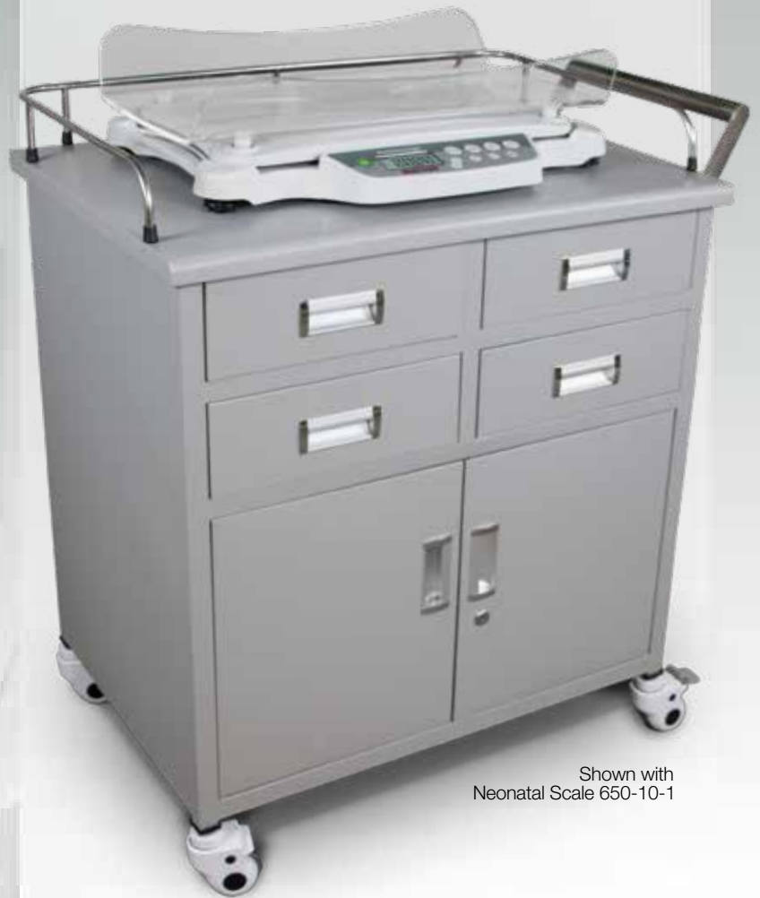
Shown with Neonatal Scale 650-10-1