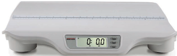
Figure 1-1. VS-10 Digital Veterinary Scale

Warranty information is available at www.ricelake.com/warranties