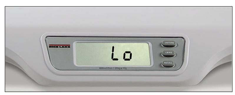
Figure 2-2. Low Battery Indicator

The VS-10 can also be powered by four AA alkaline batteries if an additional power source is not available. A battery powered scale automatically turns off after two minutes of not being used to save battery life. Replace the batteries or connect to an AC power source as soon as possible if the low battery indicator ( Lo ) displays.