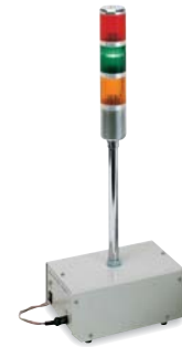
AD-8951 Comparator Light