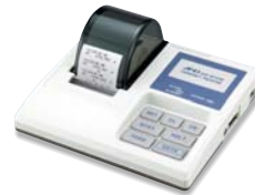
AD-8121B Dot Matrix Compact Printer