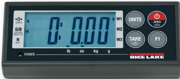
Large 1 inch backlight setting

The BenchPro BP-P digital postal scale is designed to streamline your company's mailing services. Time spent traveling to and from the local post office and waiting in long lines can be costly. Risking returns or spending extra money for postage due to estimates can also hurt the bottom line. Instead of estimating, install a BenchPro BP-P connected directly to the USPS or Canada Post within your company and get a step ahead.