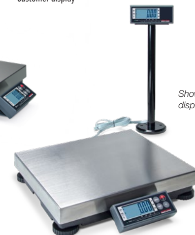
Shown with mounted display option