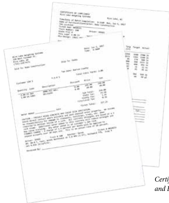
Certificate of Compliance and Batch Ticket

To view CB-3 overview videos, please visit our website at www.ricelake.com/videos